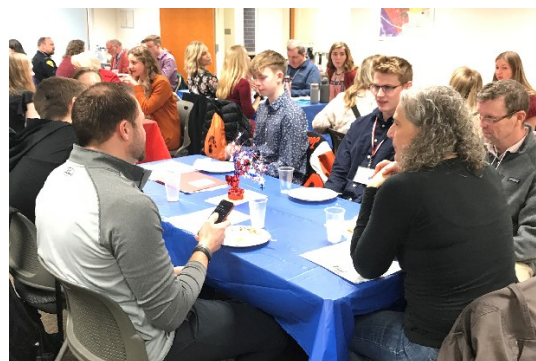
Above: 2019-2020 F.L.A.G. Public Issues that Matter Capstone Open House ; below, 2019-20 Virtual Open House.