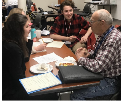
Above: 2019-2020 F.L.A.G. participants during Co. Bd. Supervisor interviews.