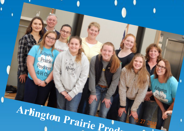
Arlington Prairie Producers