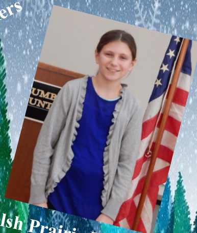
Welsh Prairie Livewires

Blue & Gold Club Achievement Award Recipients