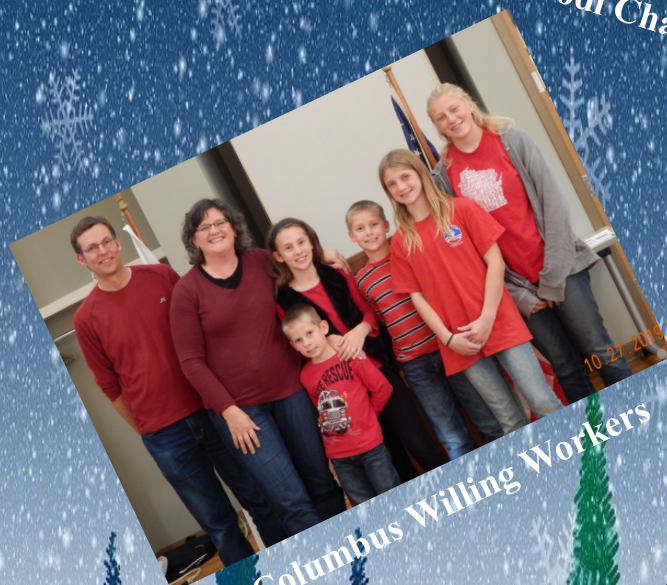
South Columbus Willing Workers