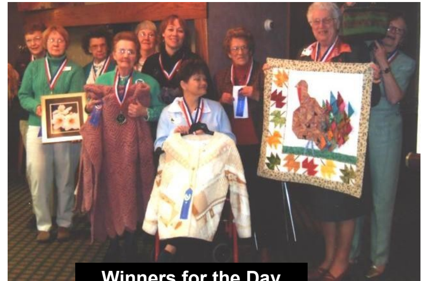
Winners for the Day