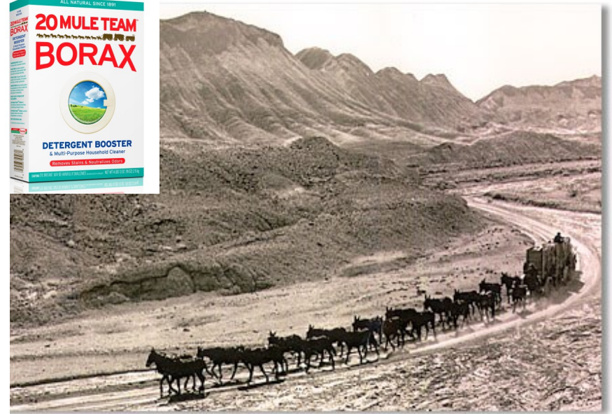
20 Mule Team

We did not get to Boron to visit the borax mines, an industry that employs many people in the area. It has one of the richest borate deposits in the world and supplies borate to over 1,000 countries. Borate was found in Death Valley and runs as far as the Mojave desert, which is where Boron is. In the 1800's, borax would be hauled by a twenty-mule team (where the detergent gets its name) to rail heads and would carry feed and supplies back to the mines. Borax is used in agriculture, ceramics, detergents, glass, insulation, nuclear energy, textile fiberglass, wood protections and biocides.